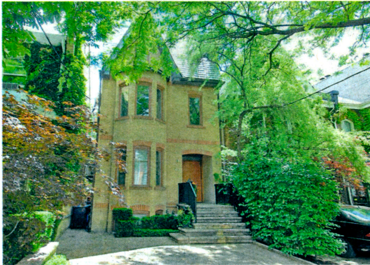
The heritage façade of 43 Elgin hides a contemporary reno inside.